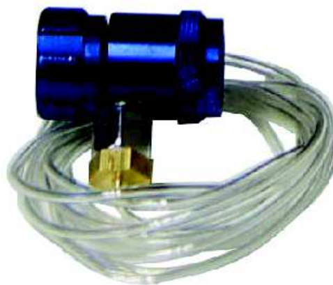
Coupler with Filter